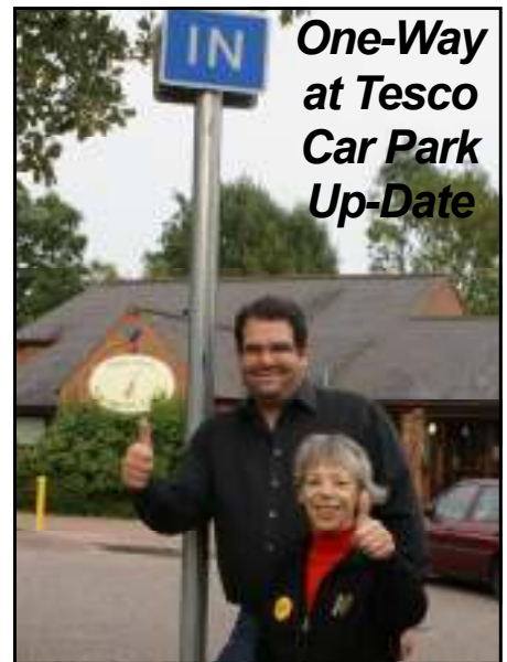
One-Way at Tesco Car Park Up-Date