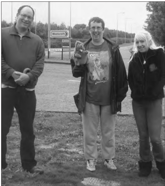
The Focus Team and Harry the Hedgehog inspecting the remedial work done by Ian Smith Construction

Concerned Westcroft residents told the Liberal Democrat Focus Team that a neglectful developer had sold all their houses and moved off the site, leaving several empty post holes in the ground at the junction of Hidcote Drive and Heligan Place .