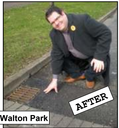
Simpson Road, Walton Park

The Lib Dem run Council are just about to start their Spring Pothole Campaign. They are spending £1 million on pothole repairs. Browns Wood roundabout shortly to be done.